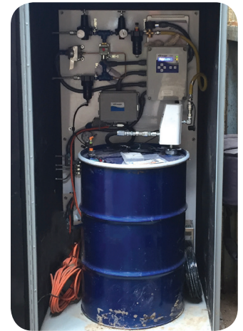
Optional Barrel Pump Enclosure

Keeping your costly jaw crusher protected from the extreme environments it operates in is essential for efficient performance. An automatic lubrication system is a fundamental part of extending critical component life leading to reduced costs of component maintenance. With unmatched lubricant delivery accuracy, our systems increase your output and production uptime. Optional custom enclosures are available for “plug-and-play” installation, along with stand-alone design that can be retrofitted with ease.